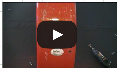
Vantage Protection Film on Trailer